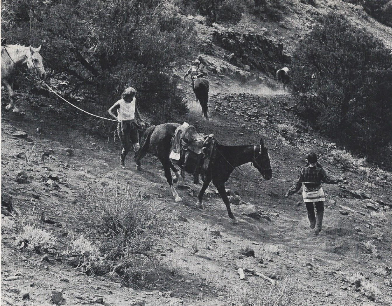
• Riders dismount to give their horses a rest as they head down a steep slope that was part of the rough terrain on the 1969 Nevada All-State Trail Ride.